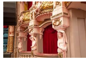
St James Theatre is within an easy stroll of hotel accommodation, great restaurants, quirky cafes, boutique shopping and Wellington's arts, culture and entertainment precinct.

For more information: https://www.onlynz.co.nz/st-james-theatre-wellington